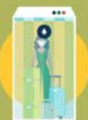
LUGGAGES AND GUESTS SANITATION